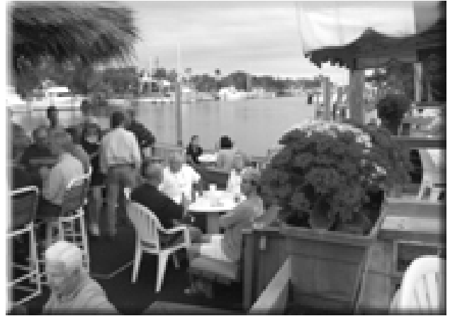
Waterway Café, Palm Beach Gardens