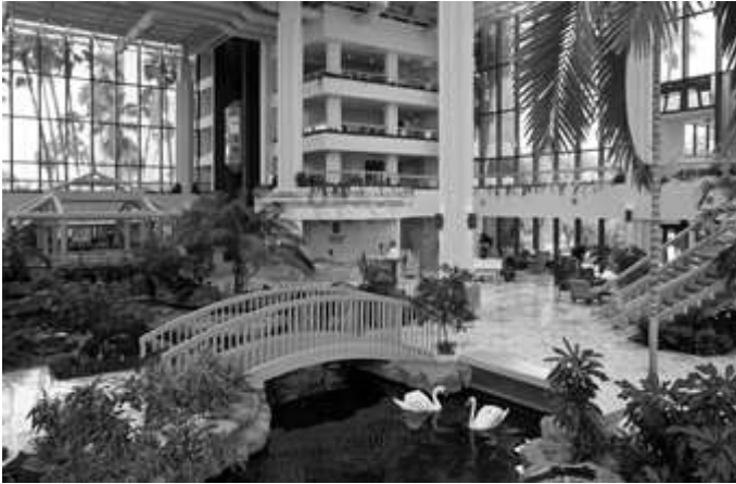
Embassy Suites, Palm Beach Gardens, FL